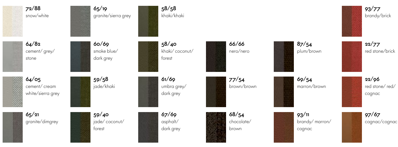
Leather Premium/back panel Plano

Premium leather is available in 22 colours.